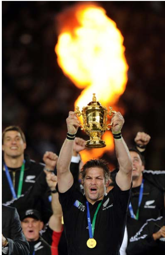
Thank you Richie McCaw (1994-1998)

They say a picture is worth a thousand words – so here's my thousand word message for October: